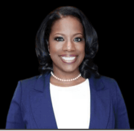
STATE'S ATTORNEY AISHA BRAVEBOY

JOIN US FOR A CELEBRATION OF BLACK ARTISTS CULTURE HEALTH AND MUCH MORE!